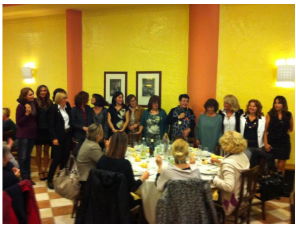
The 14 membersof Club Agora Modena 7

In that occasion, teams of volunteers told us what they did in those terrible days in order to help their people, and the deputy mayor expounded us the project for the new Voluntary Service House. In that very moment all the other Italian Agora Clubs rallied around Club Agora Modena 7 and The House for Voluntary Services in San Prospero became a National Charity Project.