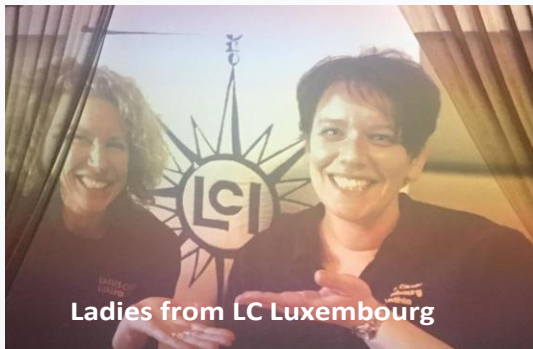
Ladies from LC Luxembourg

With bags still in the car off we went to the welcome party where