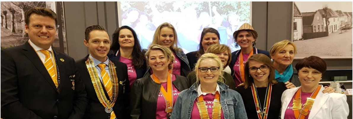
And the next day: