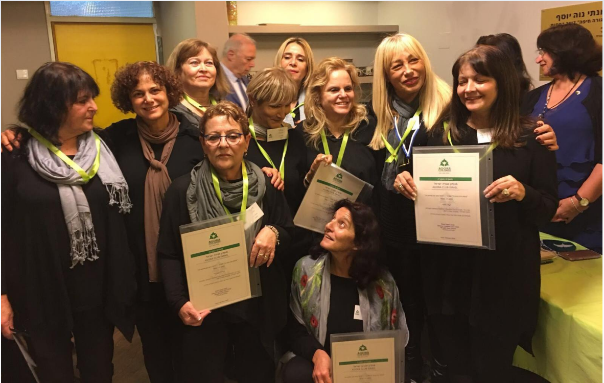
A cookbook with recipes from the group of ethnic groups and religions of " Neve Yosef" melting pot quarter in Haifa .