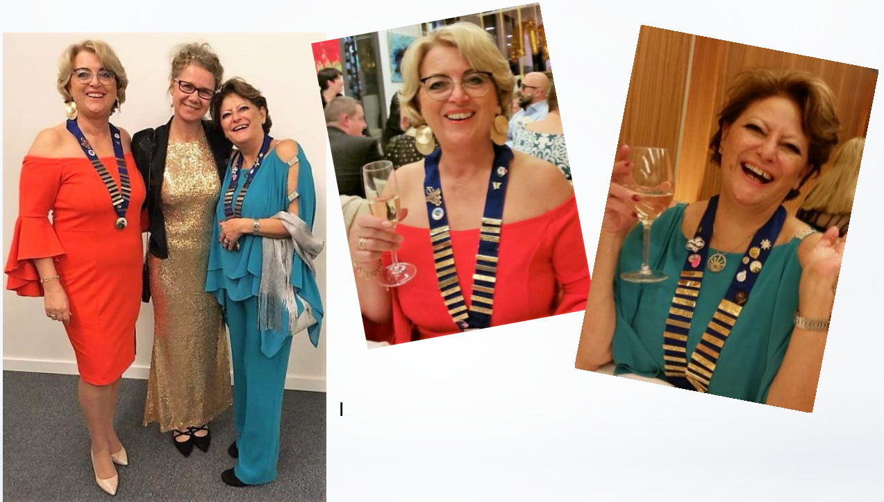
ACI-IPP, ACT GERMANY P, ACI-VP

It is amazing how deep rooted our sense of belonging in LC is, and how time is of no consequence...once a circler, always a circler. We opened our eyes, we opened our hearts and we did that little bit more fun!