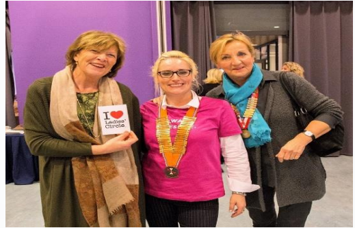
LC NL board with guests from Round Table NL, Agora Belgium and Agora NL