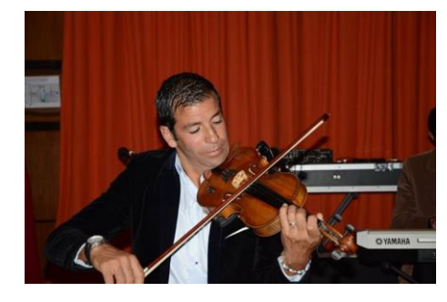
The violinist enchanted us by his talent.