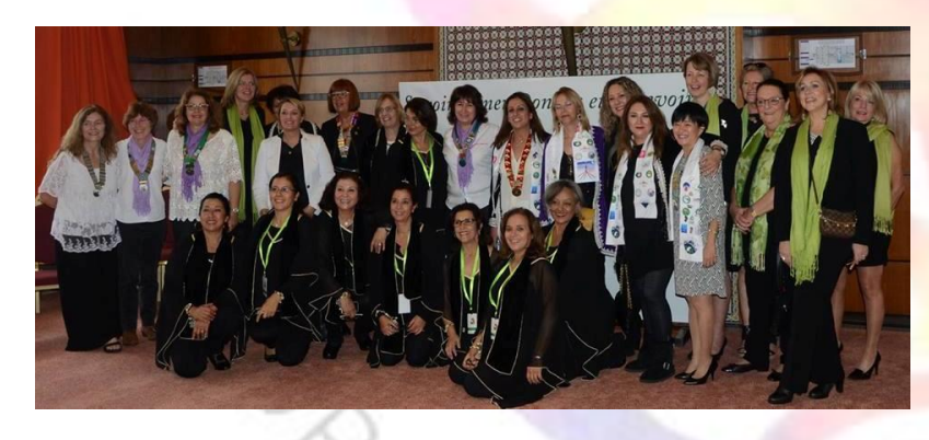
This is a great picture of the loving and sharing spirit of Agora Club

During my days in Casablanca, I remained wordless in front of the beauty of friendship. I saw old friends and made new ones, I believe that friendship is one of the greatest ingredients to fulfilling life.