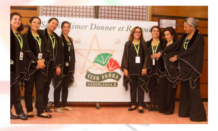
And these are the brand-new gorgeous ladies of AC Casablanca 2. They deserve a big round of applause.

Following the birth of Agora Club Casablanca 2, Agora Club Morocco could establish the National Board.