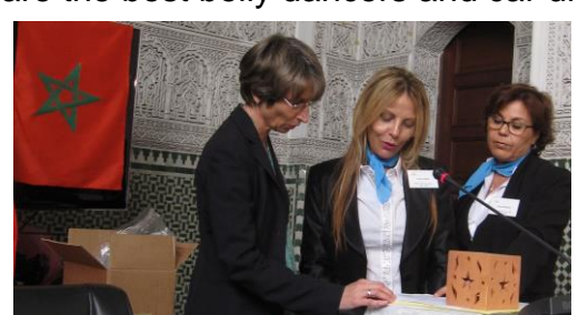
Signing the Charter Document

My mostly important highlight was the N° 1 Charter in Casablanca/Morocco with impressions of 1001 nights in this so very typical oriental manor, with absolutely spirited and lively ladies who are the best belly dancers and car drivers of the world!