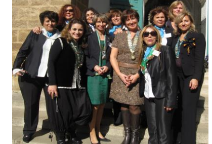
Together with Godmother Belgium